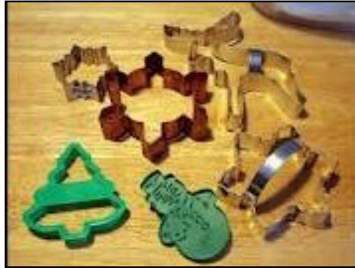
A sample of cookies cutters you can find at the Hopkins District Library!

The director is at it again! We have new and exciting things invading the library besides just books and media. COOKIE CUTTERS!!